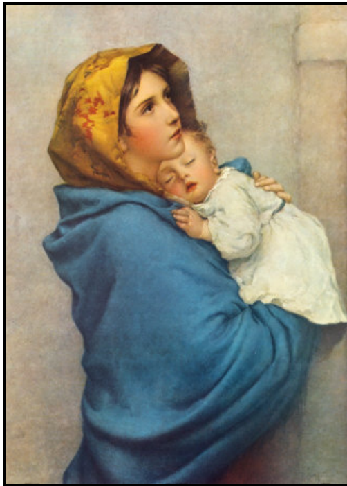
By Roberto Ferruzzi