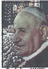
St. John XXIII

Vatican II in Plain English (Vol 3) - Decree on the Apostolate of the Laity - Page 22