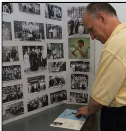
Participants has an opportunity to view historical display boards and memorabilia.